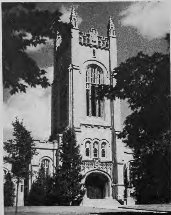
SKINNER MEMORIAL CHAPEL CARLETON COLLEGE NORTHFIELD, MINNESOTA